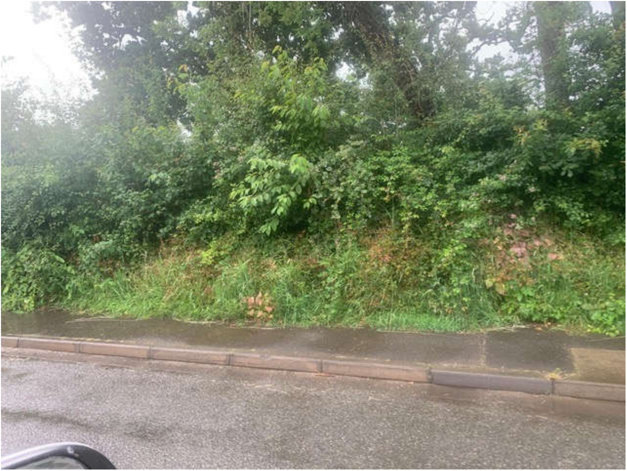
View of land from Dereham Road